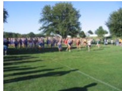
Start of the varsity girls race.