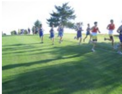
STC boys in the JV race.